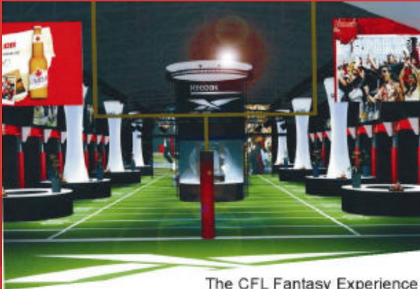
The CFL Fantasy Experience